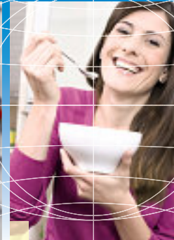
Food & Nutrition